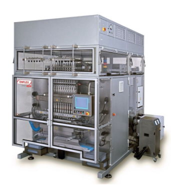
he Enflex PHS Series is available in multiple-lane setups

Volpak, a Coesia company, is launching a new Enflex brand series for the pharmaceutical and healthcare market: Enflex PHS Series, which comes in different models depending on production needs. This machine range meets the specific requirements of an industry that is increasingly interested in flexible packaging, especially in the stick-pack format.