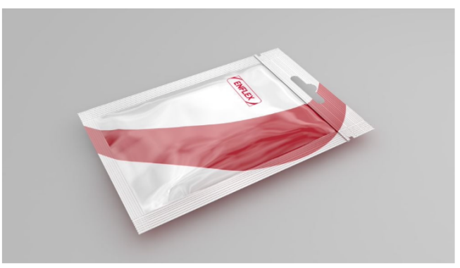
The Enflex solutions will be at the Interpack 2023 fair.

The first line constitutes a turnkey system for the Food industry: the VOLPAK SI 280 machine featuring options to manage sustainable films and automatic size changes will be integrated to an R.A Jones cartoner and a FlexLink collaborative robot palletizer.