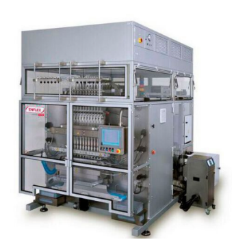
Volpak's new Enflex PHS Series comes in different models depending on production needs.

Volpak has introduced its latest solution the Enflex PHS Series for the pharma and healthcare industry. Focused on flexible packaging, the stick pack solution is a unit dosage format which proves ideal to contain and deliver liquid health products for oral and topical use.