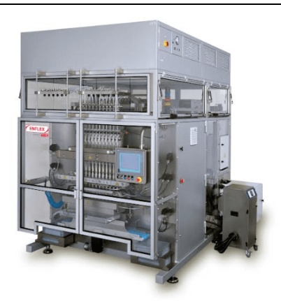
The Enflex PHS Series comes in different models depending on production needs.

Volpak, a Coesia company, is launching a new Enflex brand series for the pharmaceutical and healthcare market – the Enflex PHS Series that comes in different models depending on production needs. The machine range meets the specific requirements of an industry that is increasingly interested in flexible packaging, especially in the stick-pack format, the company said. PHS will be showcased at the Interpack trade fair, in Düsseldorf, from 4-10 May, in the Coesia booth, Hall 6 – D31 / E57.