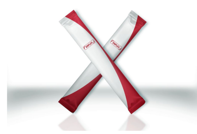
VOLPAK is exhibiting at the Interpack 2023 to present the frontier technologies in flexible packaging.

At Interpack 2023 Coesia presents GREENMATION, Coesia's response to the current trend prompted by the consumer demands towards reusable and recyclable packaging solutions, whilst manufacturers face labor shortages and production cost increases.