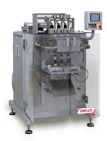
In the photo the PHS 100 model of the PHS series by Enflex.

per minute), but it also meets sustainability needs, with a reduction of 42% in wrapping material usage compared to units that are currently on the market. It is also equipped with a servomotor-based energy recovery system, allowing for savings on energy costs