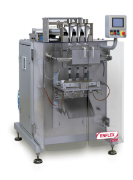
Die Enflex-PHS-Reihe ist mit dem Coesia-HMI OptiMate ausgestattet.

Volpak bietet die neue Reihe in mehrspurigen Ausführungen an, sodass unterschiedliche Anforderungen erfüllt werden können. Formatwechsel können ohne Spezialwerkzeug ausgeführt werden. Die Gesamtanlageneffektivität liegt laut Unternehmen bei mehr als 95 Prozent.