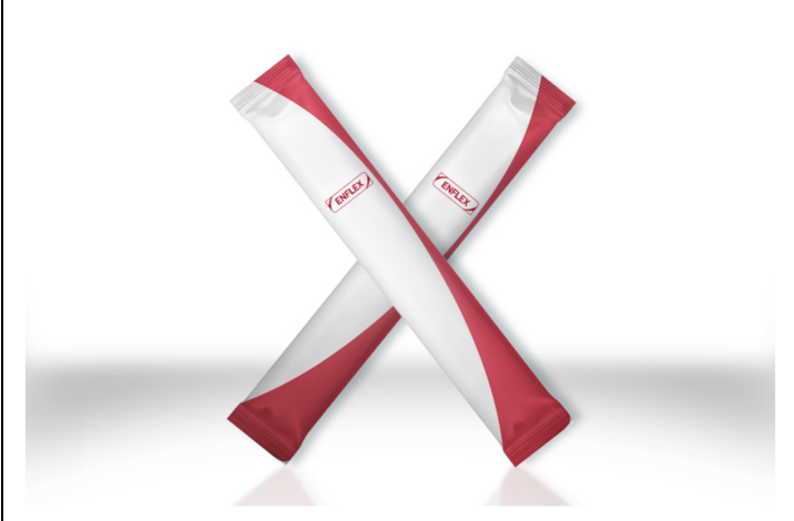
Stick Packs finden zunehmend Anwendung im Pharmabereich, etwa bei flüssigen Medikamenten zur oralen Aufnahme.