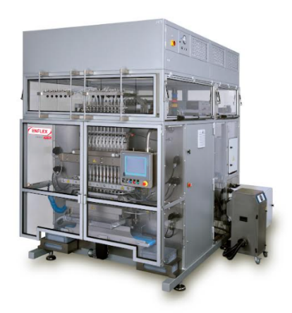
The Enflex PHS Series comes in different models depending on production

Volpak, a Coesia company, is launching a new Enflex brand series for the pharmaceutical and healthcare market – the Enflex PHS Series that comes in different models depending on production needs. The machine range meets the specific requirements of an industry that is increasingly interested in flexible packaging, especially in the stick-pack format, the company said. PHS will be showcased at the Interpack trade fair, in Düsseldorf, from 4-10 May, in the Coesia booth, Hall 6 – D31 / E57.